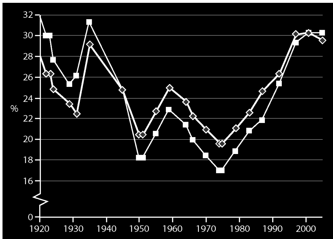
Figure 1: Inequalities in survival chances to age 65 by area in Britain, 1920-2006

Note: The line marked by white squares shows how much lower the age-sex standardised under age 65 mortality rate of the best-off 10% by area is as compared to the average. The line marked by dark diamonds shows how much higher that of the worst-off 30% is than the average.