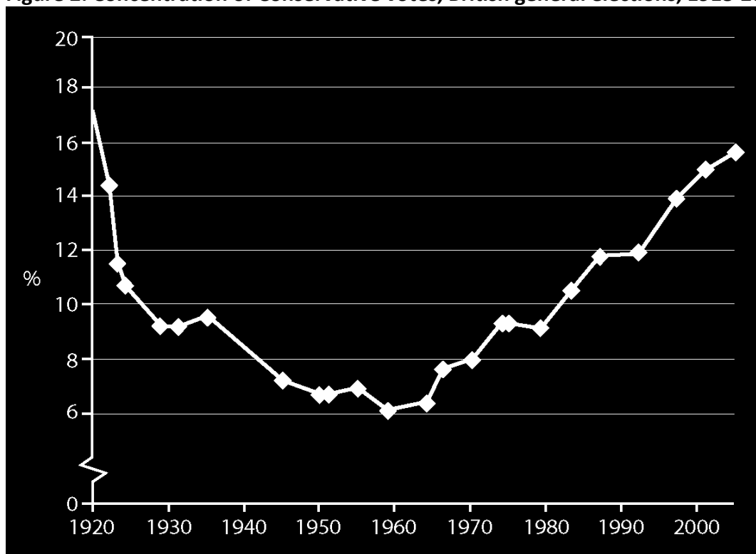
Figure 2: Concentration of Conservative votes, British general elections, 1918-2005